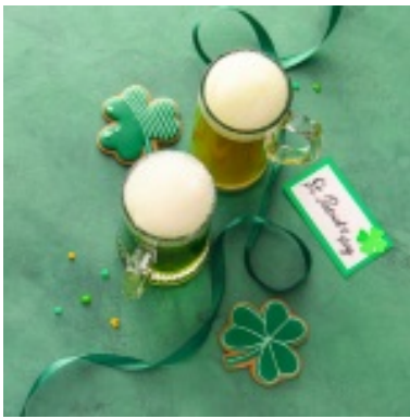
St. Patrick's Day Parade